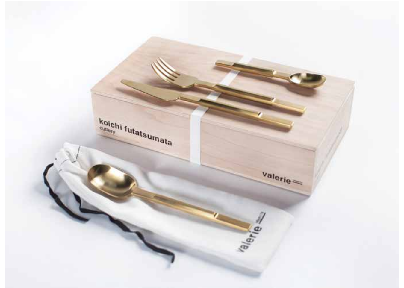
cutlery by koichi futatsumata