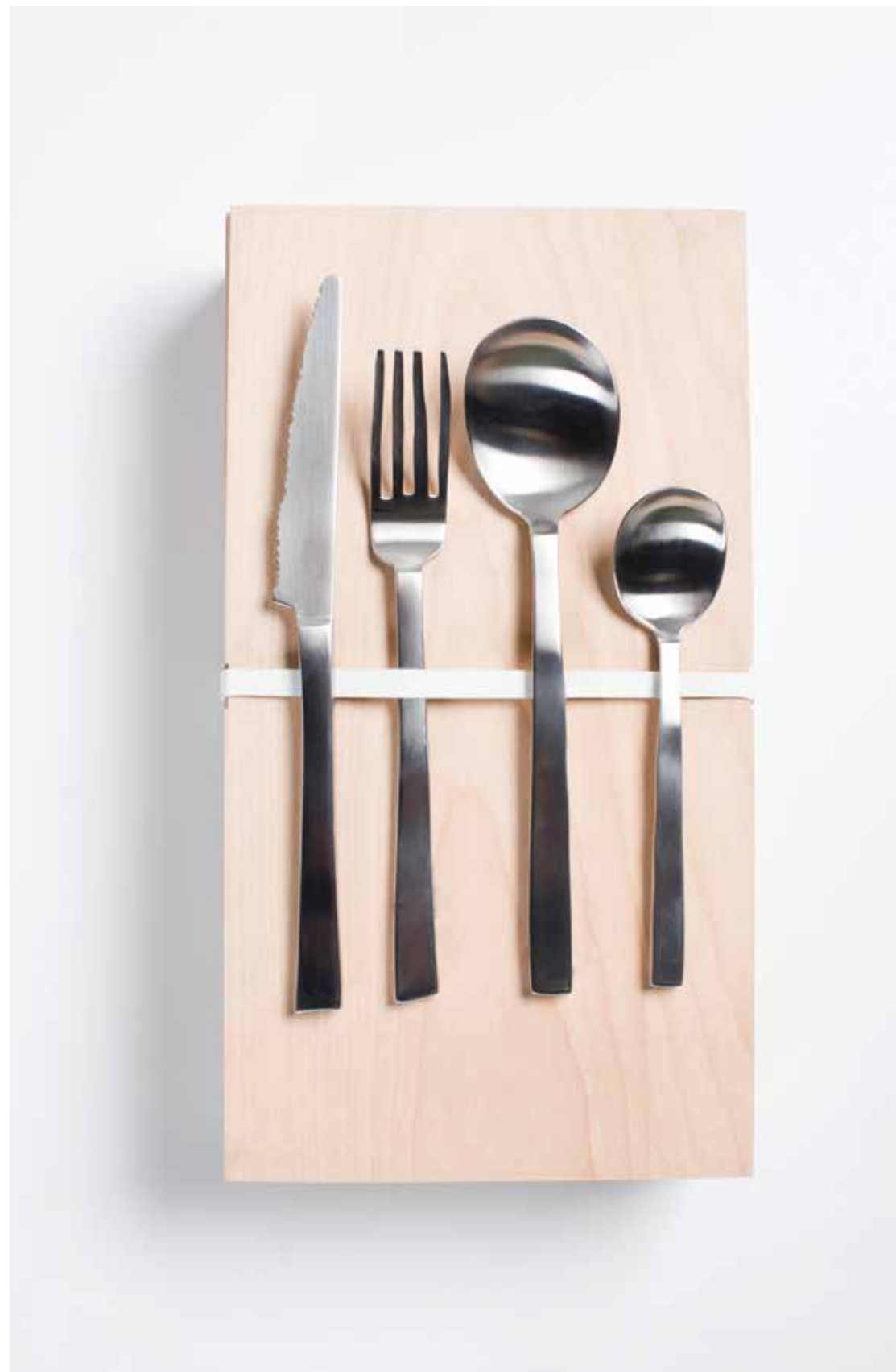
wooden giftbox for 16 pieces (4 sets) brushed stainless