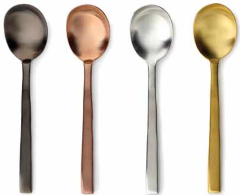
black brushed copper brushed brushed stainless brass brushed