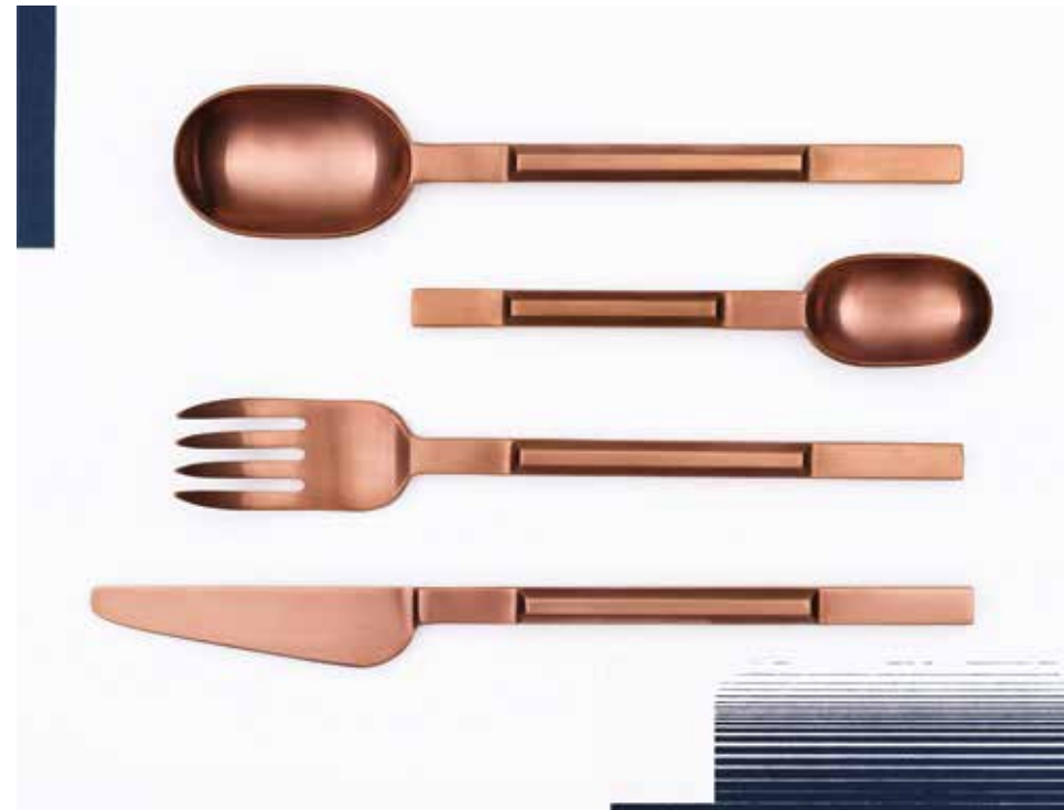
^ black brushed < copper brushed