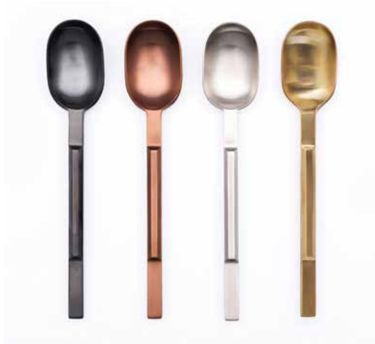
black brushed copper brushed brushed stainless brass brushed >